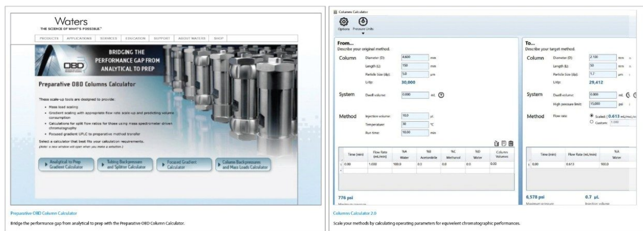
Figure 2. Waters Preparative OBD Column Calculator and the Columns Calculator 2.0 online method adjustment calculators ( www.waters.com ).

Manual gradient calculations for the target columns were confirmed using both the Waters Preparative OBD Column Calculator, and the Columns Calculator 2.0 (Figure 2). Online calculators were especially important because they provided an estimated maximum gradient backpressure for the adjusted gradients. This estimation, although computed for 100% organic mobile phase composition, rather than 85% organic composition in the monograph, added confidence that the adjusted methods would not exceed the 10,000-psi backpressure limit of the Alliance iS HPLC System.