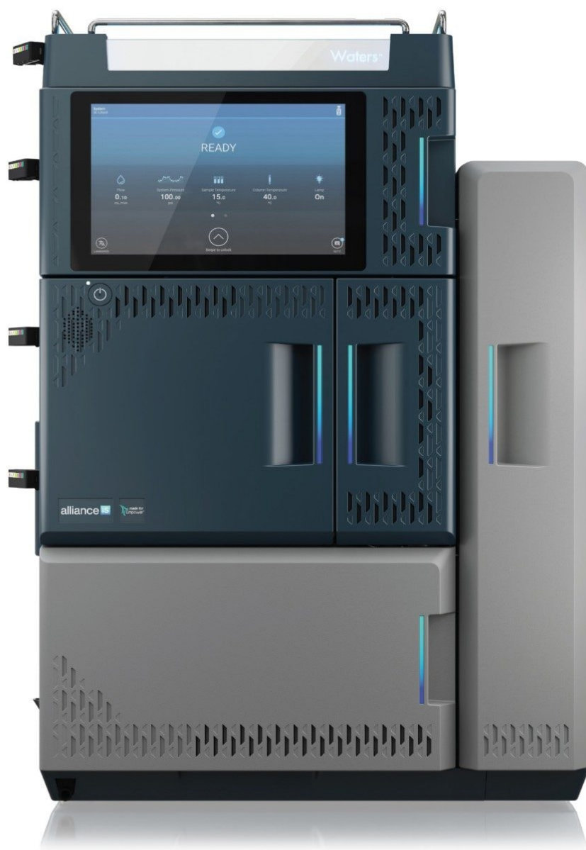
Figure 1. Alliance iS HPLC System with Tunable UV Detector.

In this application note, we employ the gradient method allowances described in General Chapter <621> Chromatography to achieve both column and system modernization for a representative USP monograph (Table 1).