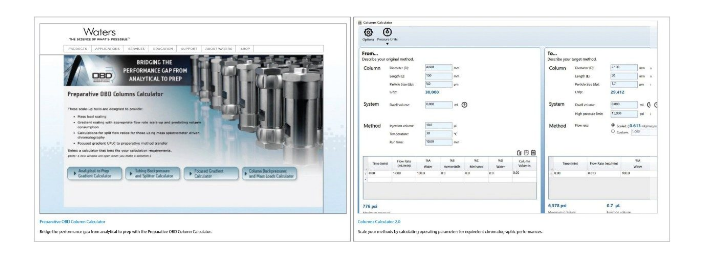
Figure 2. Waters Preparative OBD Column Calculator and the Columns Calculator 2.0 online method adjustment calculators (www.waters.com).

Manual gradient calculations for the target columns were confirmed using both the Waters Preparative OBD Column Calculator, and the Columns Calculator 2.0 (Figure 2). Online calculators were especially important because they provided an estimated maximum gradient backpressure for the adjusted gradients. This estimation, although computed for 100% organic mobile phase composition, rather than 85% organic composition in the monograph, added confidence that the adjusted methods would not exceed the 10,000-psi backpressure limit of the Alliance iS HPLC System.