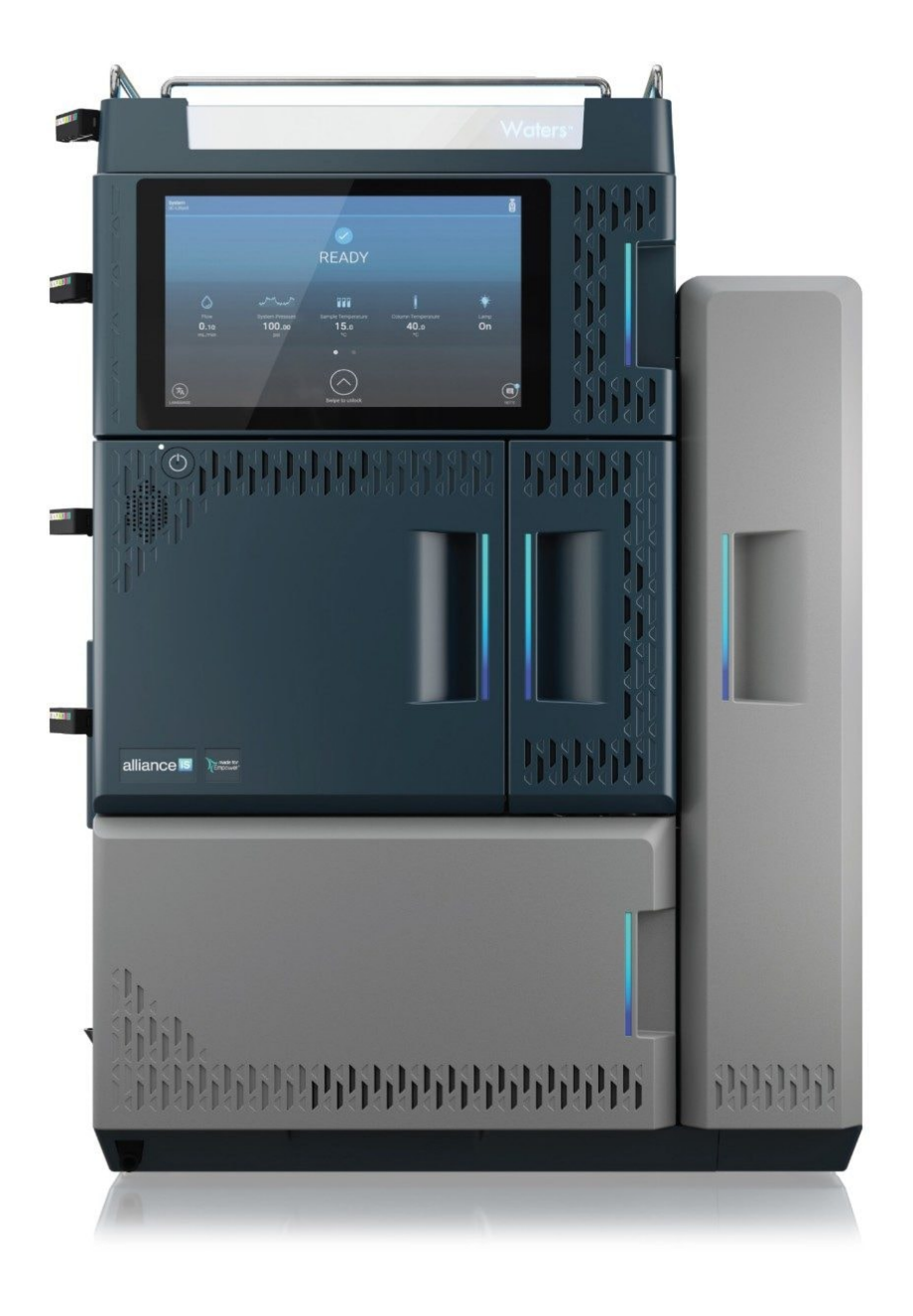
Figure 1. Alliance iS HPLC System with Tunable UV Detector.

In this application note, we employ the gradient method allowances described in General Chapter <621> Chromatography to achieve both column and system modernization for a representative USP monograph (Table 1).