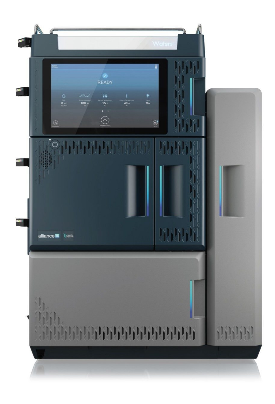
Figure 1. Alliance iS HPLC System with Tunable UV Detector.

In this application note, we employ the gradient method allowances described in General Chapter <621> Chromatography to achieve both column and system modernization for a representative USP monograph (Table 1).