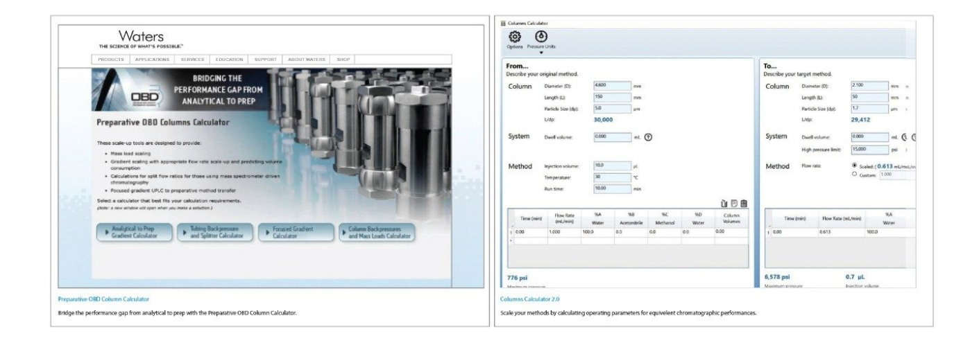
Figure 2. Waters Preparative OBD Column Calculator and the Columns Calculator 2.0 online method adjustment calculators (www.waters.com).

Manual gradient calculations for the target columns were confirmed using both the Waters Preparative OBD Column Calculator, and the Columns Calculator 2.0 (Figure 2). Online calculators were especially important because they provided an estimated maximum gradient backpressure for the adjusted gradients. This estimation, although computed for 100% organic mobile phase composition, rather than 85% organic composition in the monograph, added confidence that the adjusted methods would not exceed the 10,000-psi backpressure limit of the Alliance iS HPLC System.