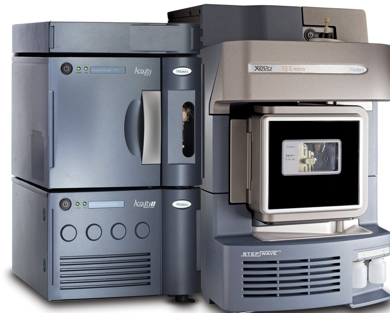
Figure 1. ACQUITY UPLC I-Class and Xevo TQ-S micro configuration.