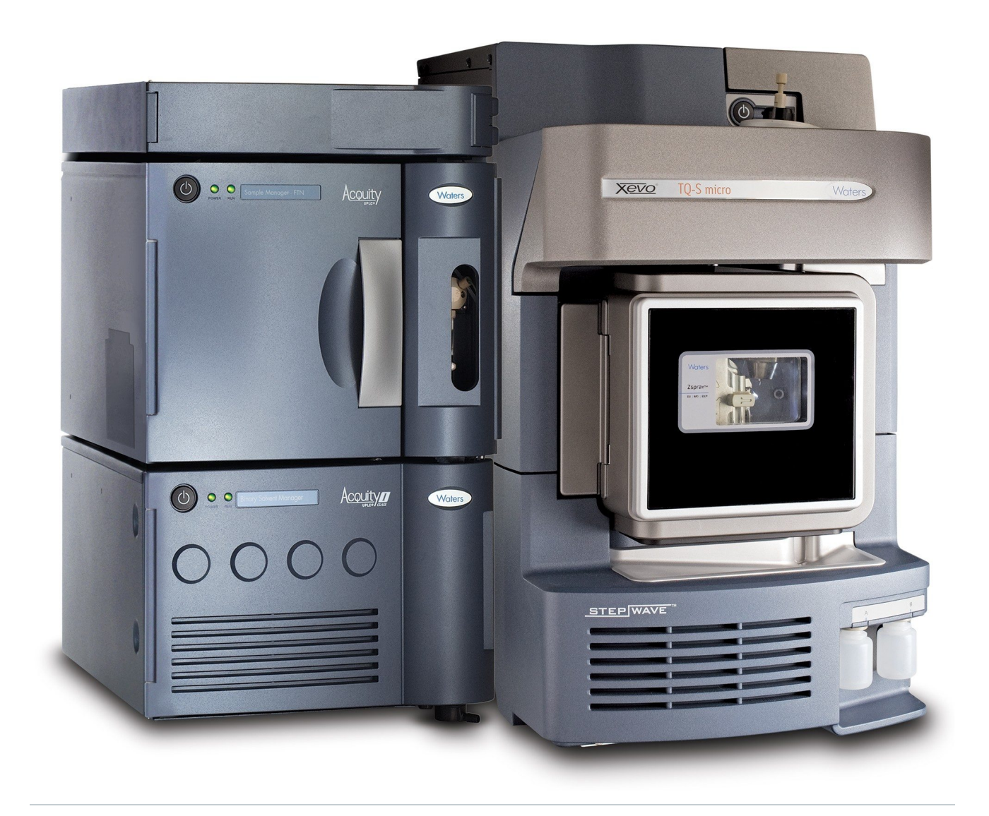
Figure 1. ACQUITY UPLC I-Class and Xevo TQ-S micro configuration.