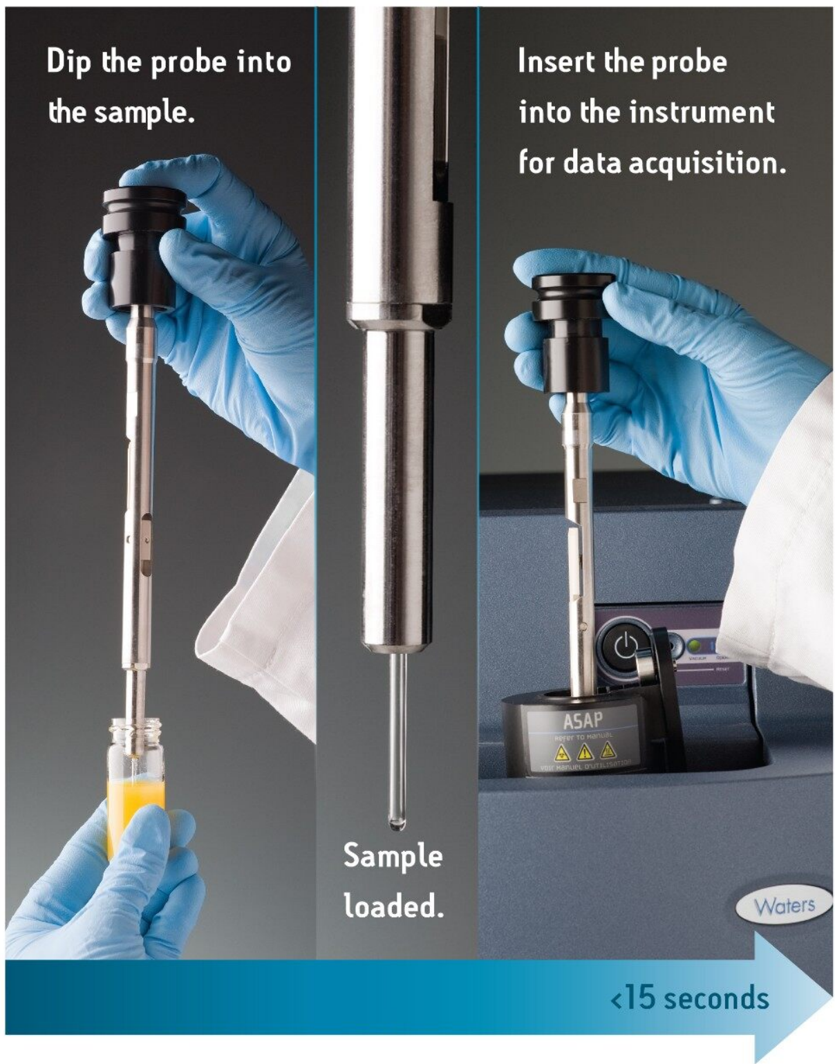
Figure 1. The sample is loaded directly onto the tip of a glass capillary. The sample is then directly inserted