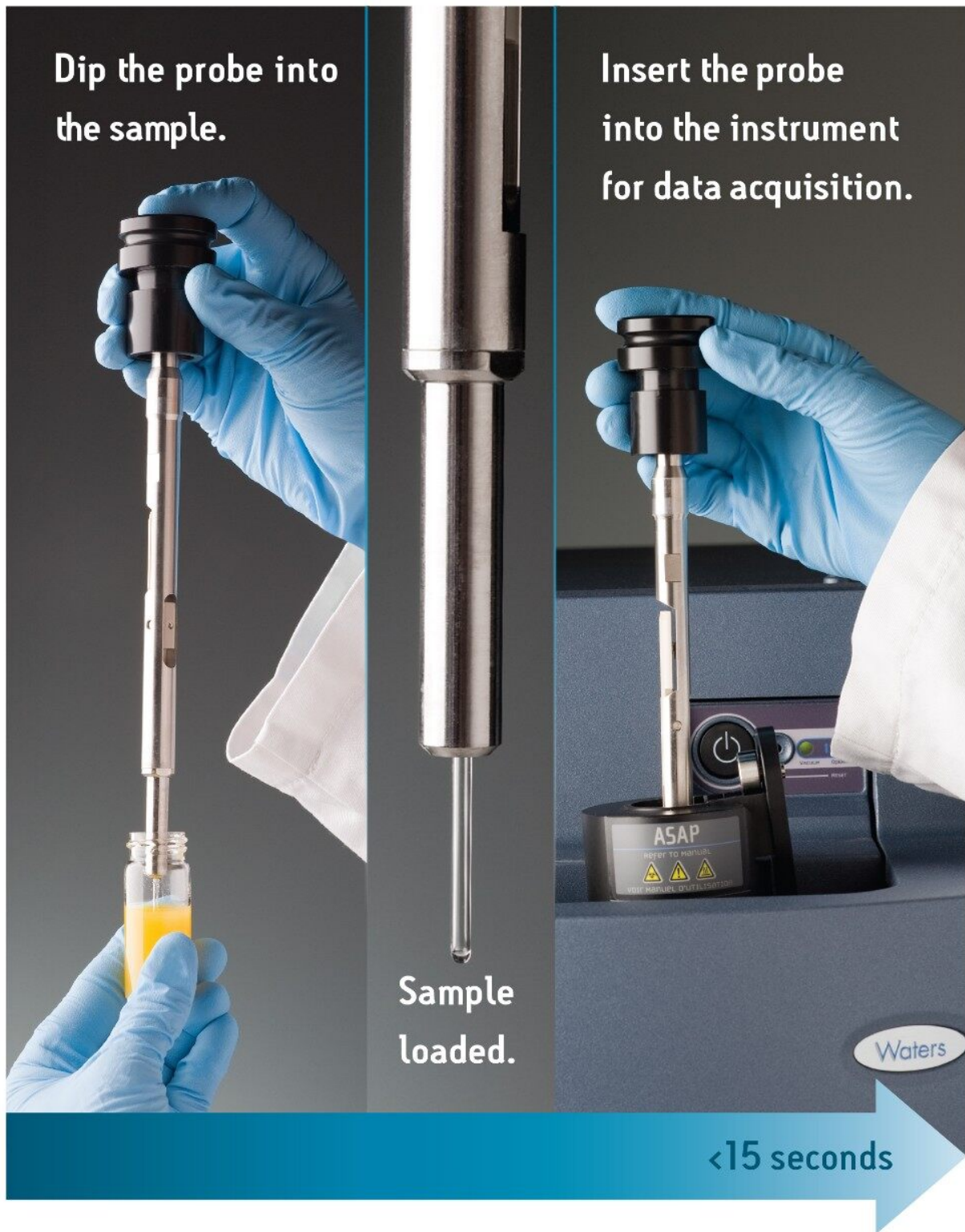
Figure 1. The sample is loaded directly onto the tip of a glass capillary. The sample is then directly inserted