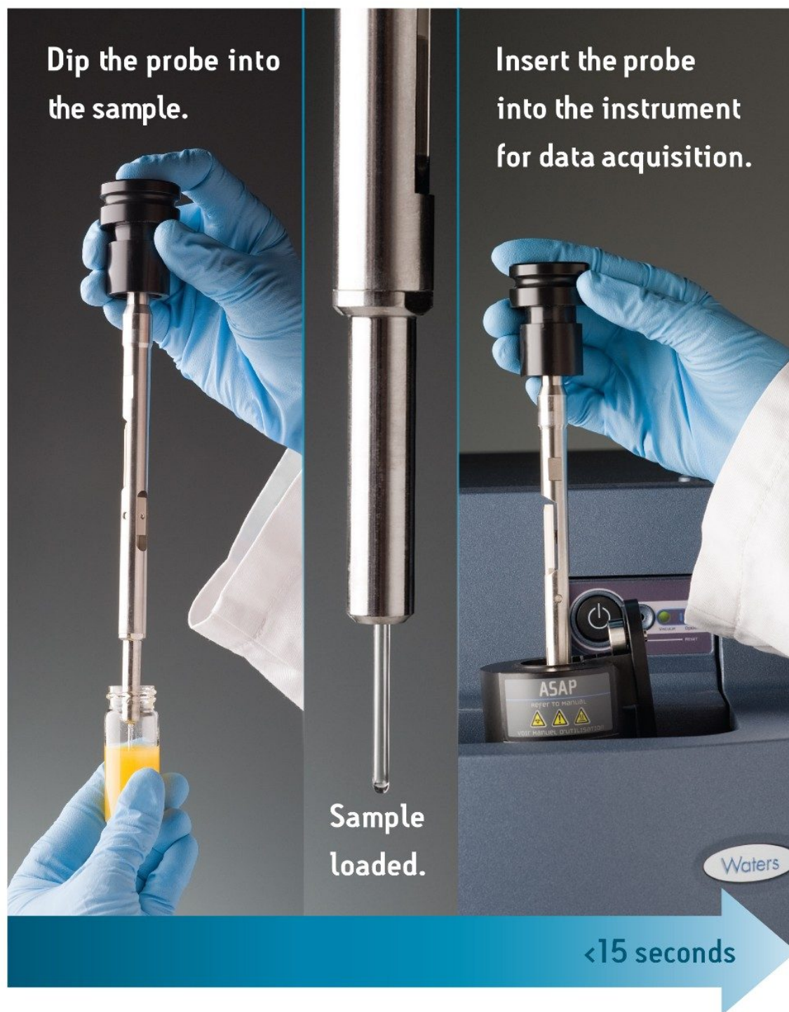
Figure 1. The sample is loaded directly onto the tip of a glass capillary. The sample is then directly inserted into